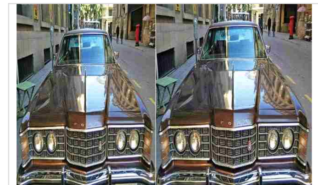
(The algorithm cut the image...)

Closer home in Mumbai is a company that may soon live that scenario. Adstringo's algorithm can reduce the file size of images, audios and videos by about 90% with no noticeable loss.